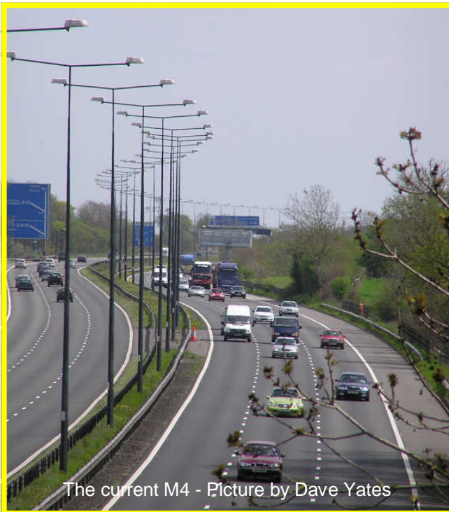
The current M4

I really hope to see you all at our lobby of the Welsh Assembly this month. On Tuesday 23 rd September, we have arranged to be outside the Assembly debating chamber (the Senedd, in Cardiff Bay), for an hour from noon, to show our concern about this awful road scheme. I really hope you will manage to make it – we need to show that there are many people with deep concerns about a new M4. Get in touch with the Wildlife Trust (01600-740600, sjones@gwentwildlife.org ) if you want to share space in your car, or you want to join us in one of the buses we are organising.