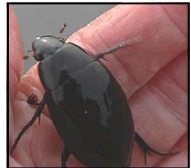
Great Silver Beetle - Hydrophilus piceus . Length 40mm.

The proposed 'new M4' would be devastating to the local environment if built, and a horrible blight on local communities. As a nature conservationist, I have so many concerns about the impact on the Gwent Levels. This is such a sensitive ecosystem. The reens – ancient drainage ditches – are Gwent's rainforest in biodiversity terms. Numerous developments over the years have already nibbled away at the Gwent Levels – surely it is time to say enough is enough. The threat of this road is not just in its land take to the road itself, but it threatens insidious water pollution which will flow throughout the reen system around the whole of the Levels, poisoning this freshwater habitat. If this road is built, I suspect that the change will lead to the extinction of species found nowhere else in Wales – such as the great silver beetle (a fabulous water beetle, also Britain's largest beetle) – as well as the sad sight of the carcasses of barn owls and otters regularly littering the motorway verges over the years.